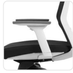
Multi Directional Adjustable Arms