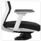
Standard Seat Foam