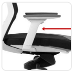
Adjustable Seat Depth