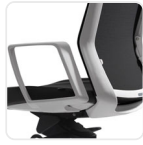
Flare Fixed Arms