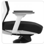
Plush Seat (Extra Foam)