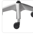
White Nylon Base