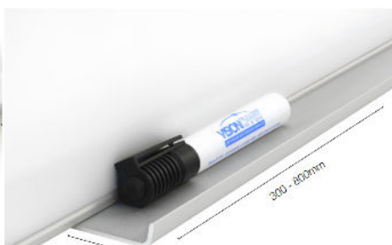
Aluminum Pen Tray Included