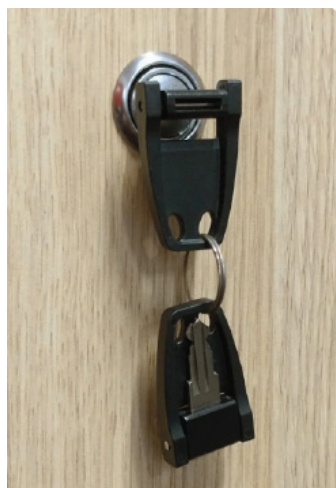
Key Lock (Standard)